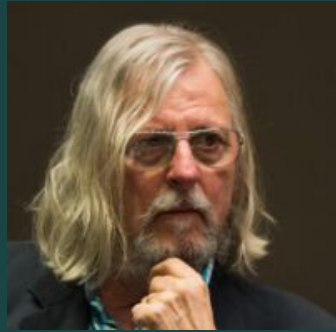
Dr Didier Raoult