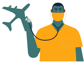
Medical tourism agency