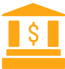
Medical insurance and banks