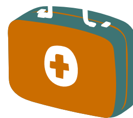
Medical equipment and drug production company